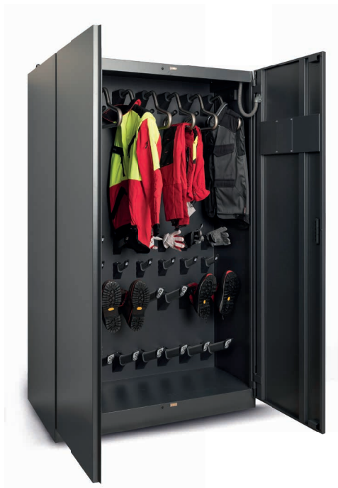
dryingCabinet speedDry (4/6/8)