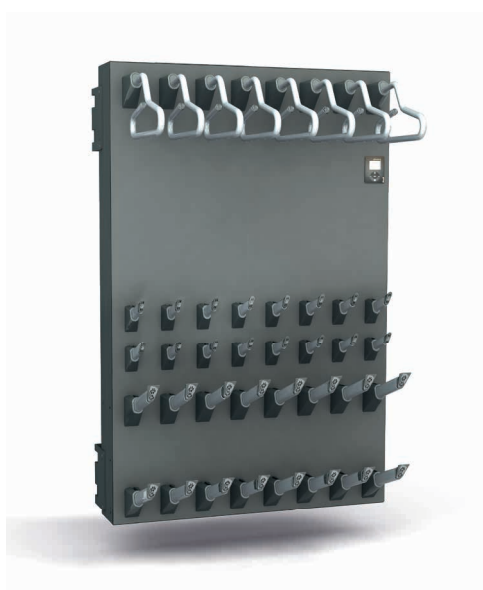
universal dryer speedDry (4/6/8)